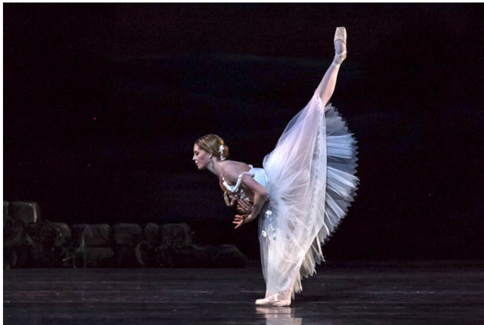
The Kansas City Ballet will perform the ghostly "Giselle" in October. Kansas City Ballet