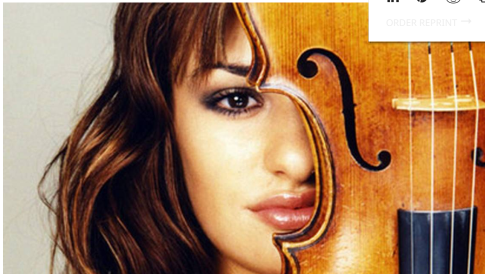
Violinist Nicola Benedetti will return to the Harriman-Jewell Series. File photo