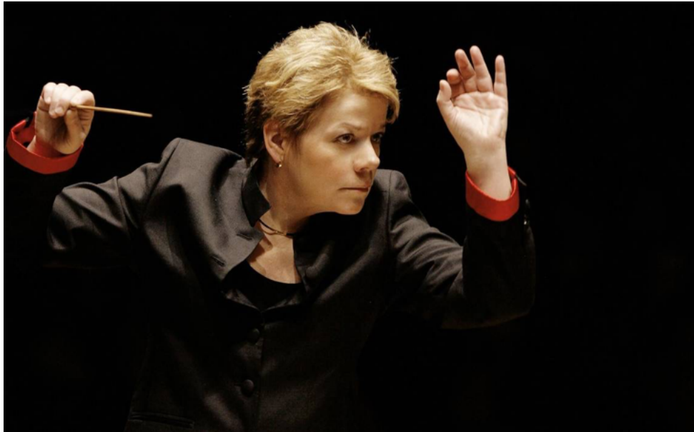
Conductor Marin Alsop will make her Kansas City debut in October. File photo