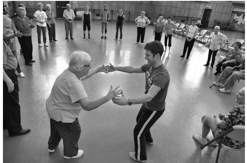
Dancers from Mark Morris Dance Group led a free "Dance for PD" class for persons with Parkinson's disease and their families, friends and care partners on September 28, 2012.